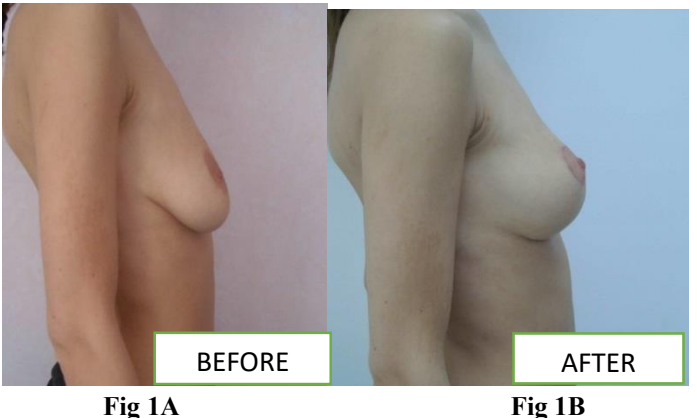
Case 2. Auto-Augmentation Mastopexy with Breast Lipofilling

Case 1. Auto-Augmentation Mastopexy with Breast Lipofilling