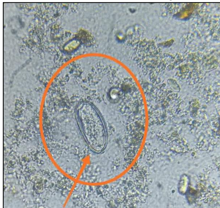
Image 1: A direct stool smear showing distinct planar convex eggs of E. vermicularis

Patients with pinworm disease have much lower levels of the divalent metal transporter protein DMT1. Because it plays an essential role in the transport and absorption of iron across the cell membrane (Montalbetti, et al. , 2013), it has been shown that there is a significant inhibition in the gene and protein expression of DMT1 during infection with some types of intestinal parasites (Roellig, et al. , 2015).