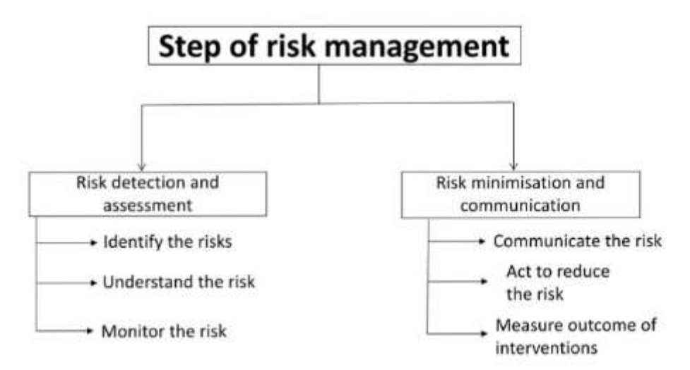
Figure No 3: Risk Management Steps